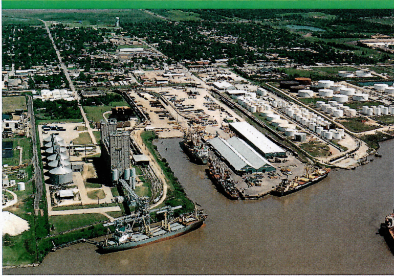
Houston Public Elevator- Houston, Texas

Arizona Grain, Inc., is a privately-held company located in Casa Grande, Arizona, a small agricultural community approximately 50 miles outside of Phoenix, the capital of Arizona. For many years, we have been supplying high quality durum wheat to the domestic markets of the United States, and many international customers located throughout Europe, Latin America and Africa.