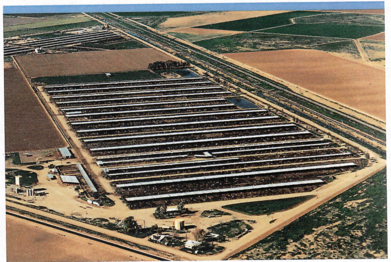
Pinal Cattle Co. feedlot- Maricopa, Arizona

Arizona Grain is actively involved in the buying, storing, and shipping of feedgrains into the state. The company ships large size grain trains from grain originators in the mid-west grain belt to Arizona Grains' facilities in Casa Grande and Buckeye, Arizona. Arizona Grain ships, via truckload quantities, corn, milo, barley, and feedwheat to the state's feedlot, feedmill, and dairy industries. The company has a reputation of timely shipments and personalized service to our feedgrain customers.