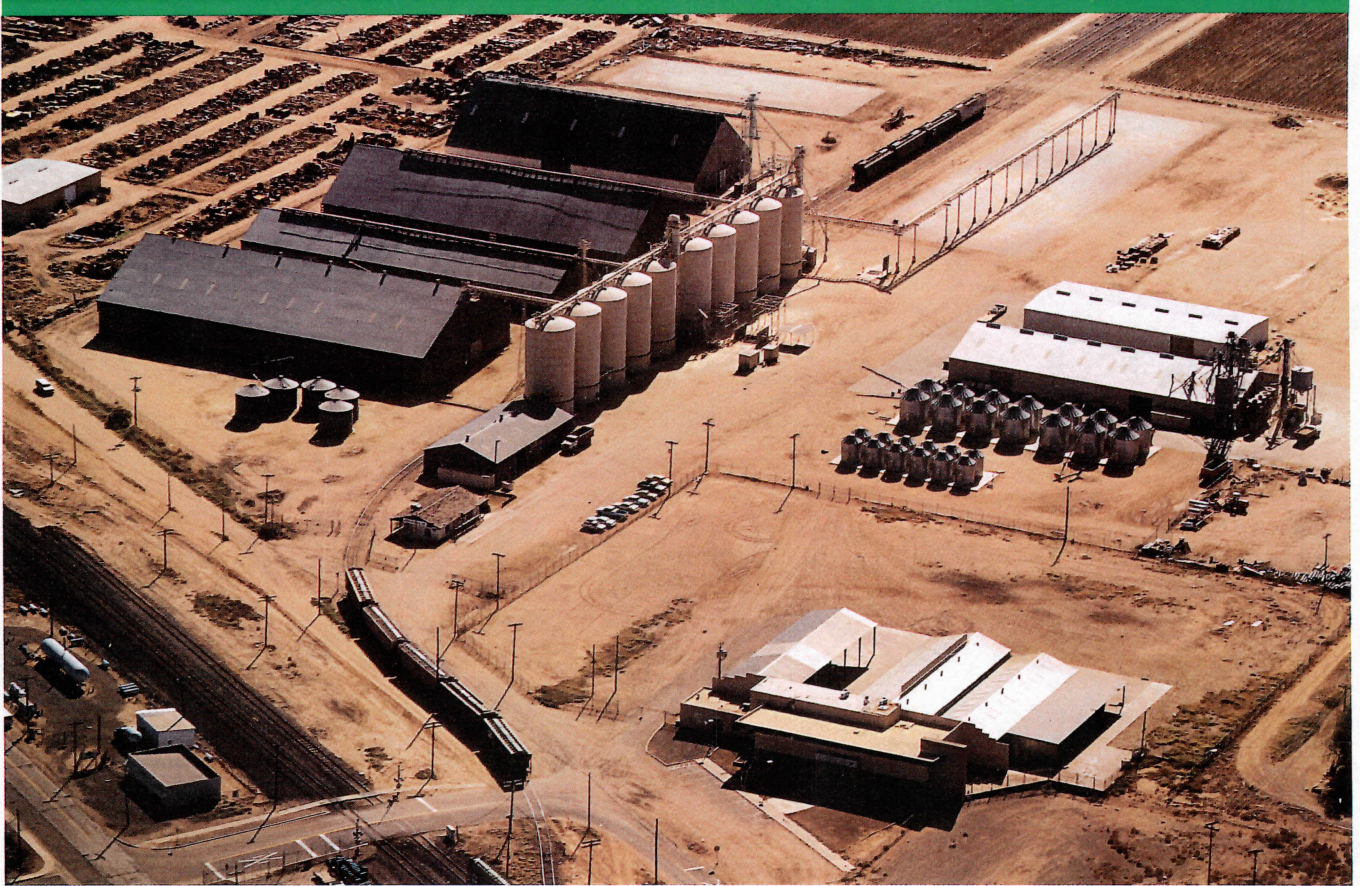
Arizona Grain, Inc.- Casa Grande, Arizona facility

As a diverse agricultural company, Arizona Grain has a seed marketing division called Valley Seed, which is primarily involved in the purchasing, conditioning, and marketing of cereal grain seeds, alfalfa seed, and Bermuda grass seed. We have a state-of-the-art Bermuda grass seed cleaning and packaging facility in Yuma, Arizona, 180 miles west of Casa Grande. Valley Seed also has a cereal seed processing plant in Casa Grande.