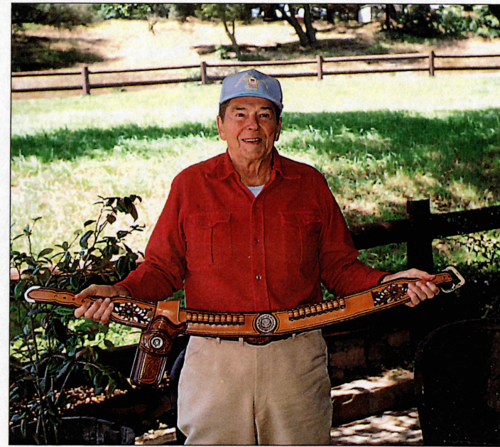
President Ronald Reagan at his Santa Barbara Ranch.