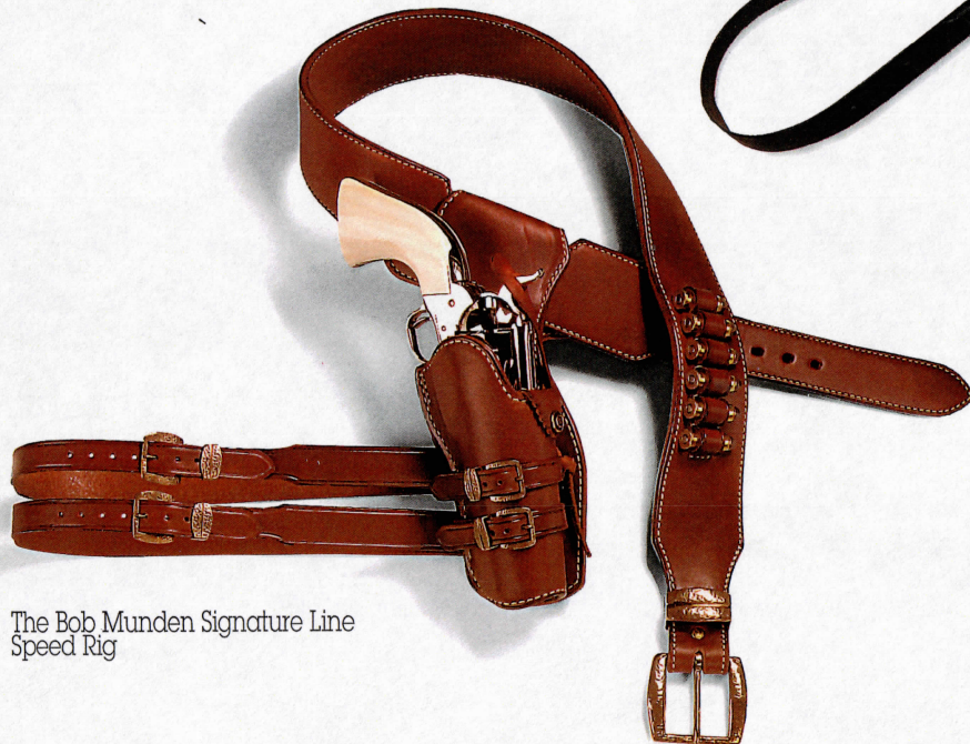
The Bob Munden Signature Line Speed Rig